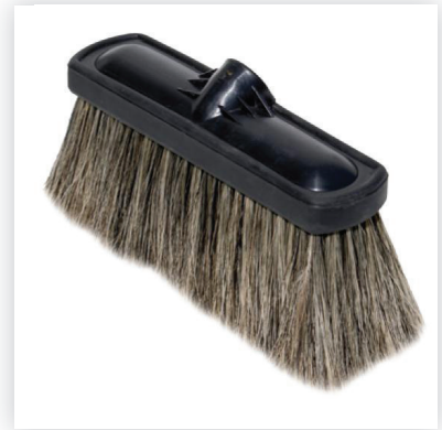
Foam Brush #1343

The highlighted accessories are designed to work along with Krown Salt Eliminator to save time and provide unparalleled results. Please use all Krown products with the appropriate safety gear.