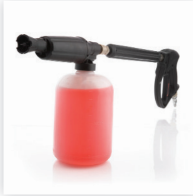
Foam Cannon #1184