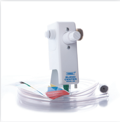
Soap Dispenser 1 Gal. per sec. #1419 4 Gal. per sec. #1418