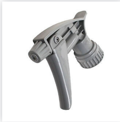
Trigger Sprayer #1277