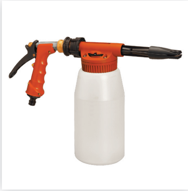
Foam Gun #1158